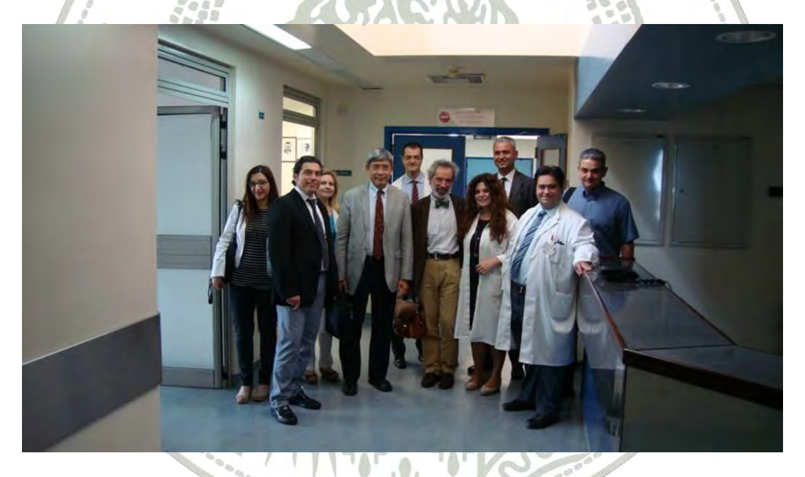
Site visit 2014