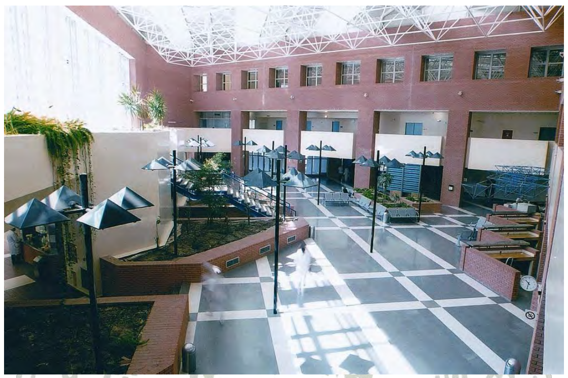
Papageorgiou Hospital – Interior